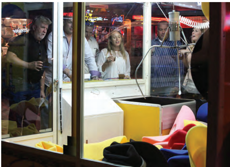
Games like this one, featuring giant foam cowboy hats, were a big hit after dinner