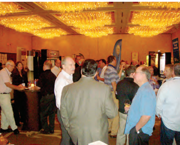
Networking and catching up at the Welcome Reception