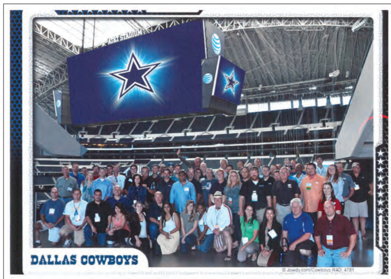
The private AT&T Stadium tour arranged by the North Texas Chapter proved to be popular and completely sold out. Attendees were wowed by the size and scope of the venue