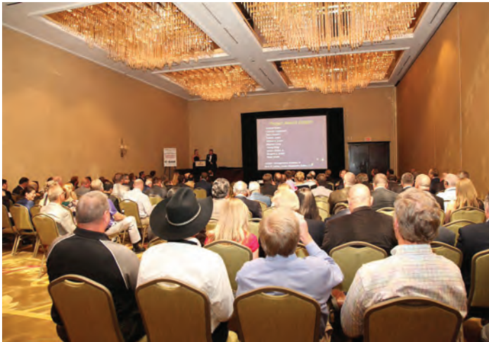
Attendees at the 23rd annual Project Awards Celebration Ceremony