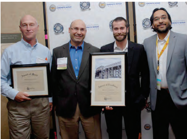
The Sika team won an Award of Excellence and an Award of Merit. They also sponsored the Red Carpet Arrivals this year