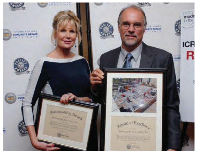
Gervasio & Associates, Inc., won an Award of Excellence and a Sustainability Award