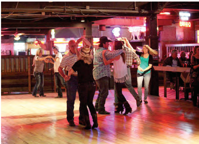
The dance floor was also a popular destination

Fort Worth was a gracious host and the volunteers of the North Texas Chapter added immeasurably to another successful ICRI convention. ICRI wishes to thank all the attendees, exhibitors, sponsors, presenters, and award winners for joining us. We hope to see everyone at the ICRI 2016 Spring Convention in San Juan, Puerto Rico, March 16-18, 2016.