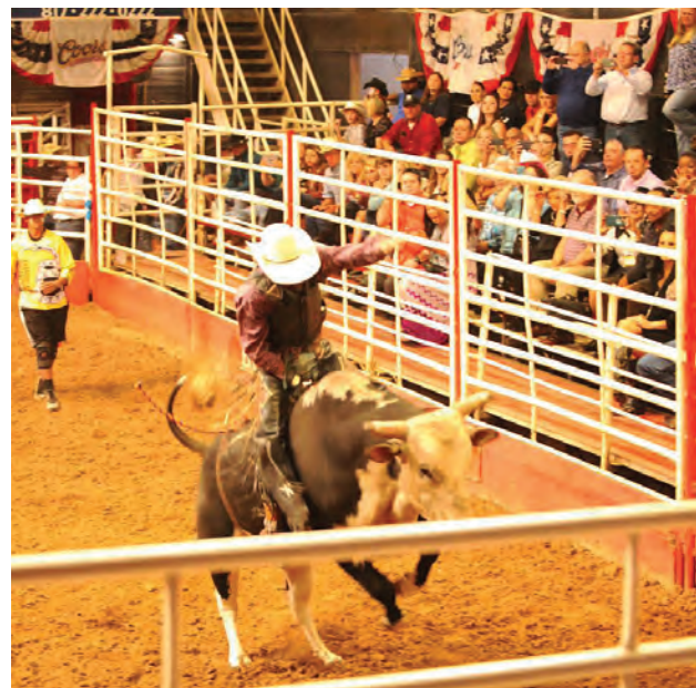
The professional bull riders were fun to watch, from a distance—and behind strong metal gates!