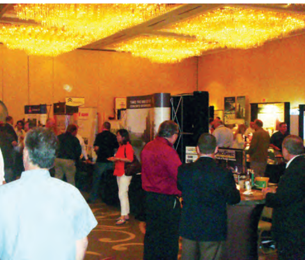
The Welcome Reception brings attendees into contact with exhibitors