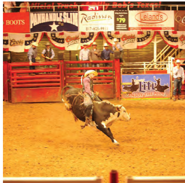
There was some excellent bull riding that night as well—by professionals. No ICRI members got in the ring (that we know of...)

Fort Worth was a gracious host and the volunteers of the North Texas Chapter added immeasurably to another successful ICRI convention. ICRI wishes to thank all the attendees, exhibitors, sponsors, presenters, and award winners for joining us. We hope to see everyone at the ICRI 2016 Spring Convention in San Juan, Puerto Rico, March 16-18, 2016.