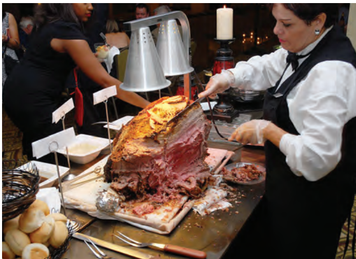
The Project Awards Celebration Ceremony was followed by a Reception that included this Texas-sized slab of beef