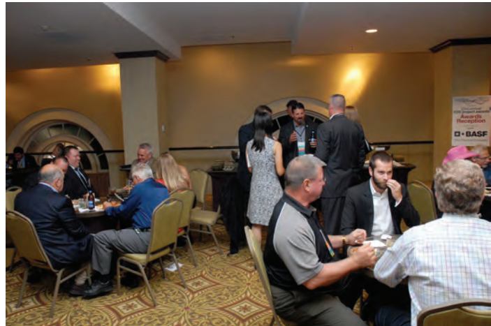
The Project Awards Reception is where the winners get to tell more stories about their award-winning projects