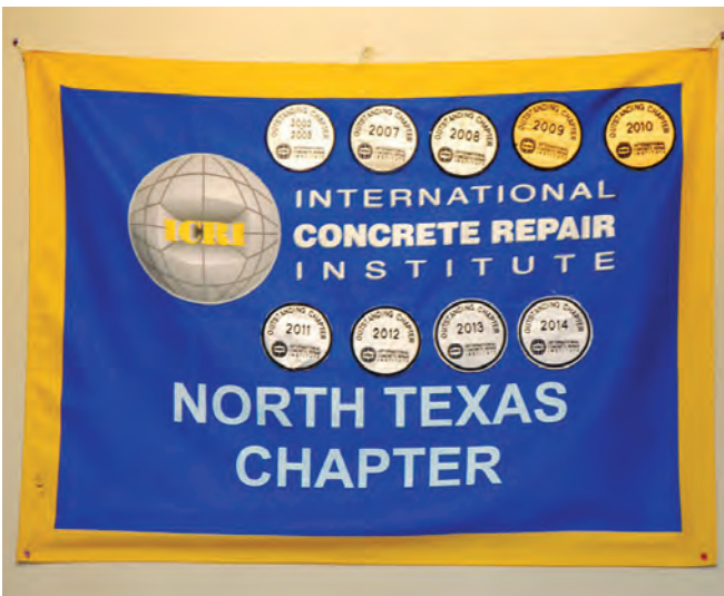
The North Texas Chapter brought out their chapter flag to help welcome attendees to Billy Bob's

The convention wrapped up with a Texas-sized event at Billy Bob's Texas. Billed as the world's largest honky-tonk, there was bull riding, country music, games, and a delicious fajita dinner. Attendees had the opportunity to stay and enjoy a concert later in the evening.