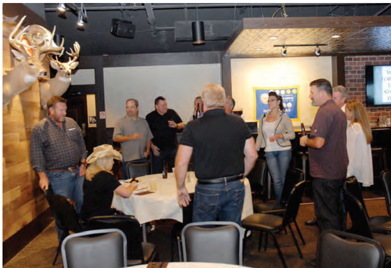
Guests of the North Texas Chapter arrived at Billy Bob's Texas for a filling fajita dinner in a private room