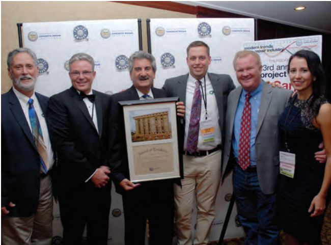
The team behind the Dolphin Towers Condominium were finalists for 2015 Project of the Year honors