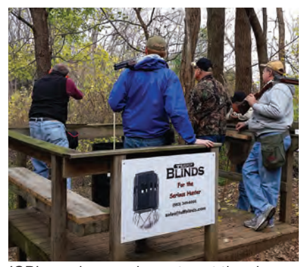
ICRI members and guests get the chance to network with each other away from offices and construction sites