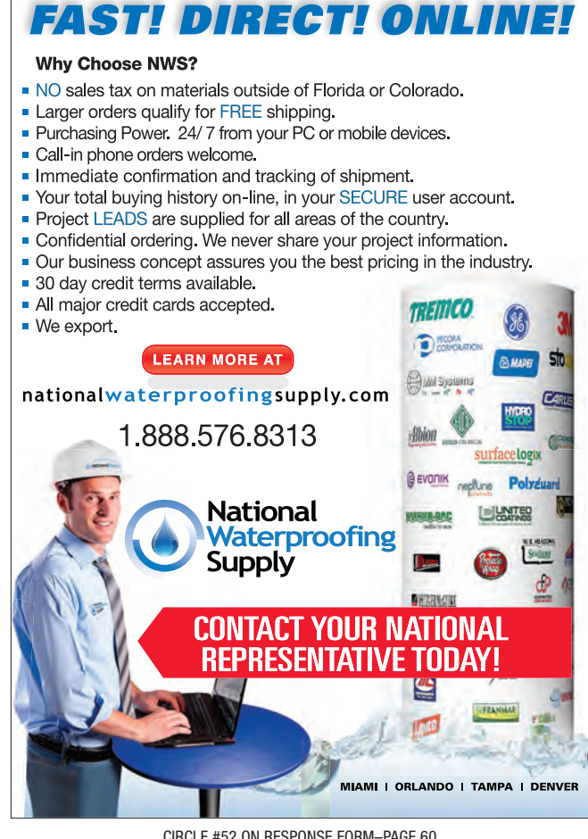
CIRCLE #52 ON RESPONSE FORM-PAGE 60