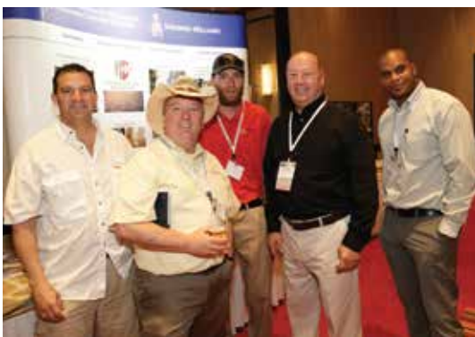
A group of attendees taking time during the Welcome Reception to visit an exhibitor