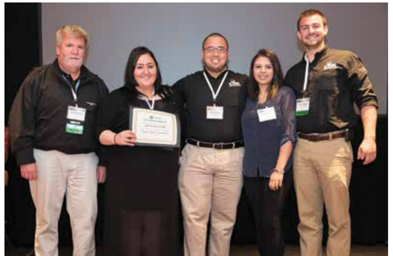
Celebrating their success during the recognition lunch are the winners of the ICRI Student Competition from the New Jersey Institute of Technology