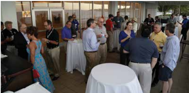
The First-Time Attendees Reception is the perfect place to familiarize yourself with the people and the events that make up an ICRI convention

devoted to committee meetings. If you are not attending ICRI Conventions, you are definitely missing out on some interesting activities and entertaining networking opportunities. We hope to see everyone at the ICRI 2016 Fall Convention in Cleveland, Ohio. We'll be at the Westin Cleveland Downtown, November 9-11, 2016. The theme for this event is "Urban Reconstruction" and you don't want to miss the 2016 Project Awards ceremony and celebration. We are getting things done at ICRI and extend an invitation for you to get involved. Make the most of your membership and come to a convention.