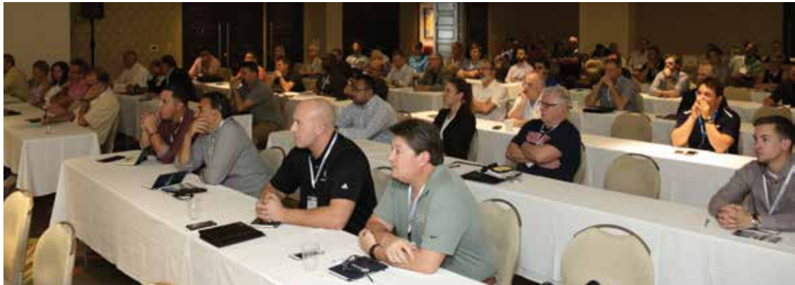
The 16 Technical Sessions at this event were a big draw for attendees