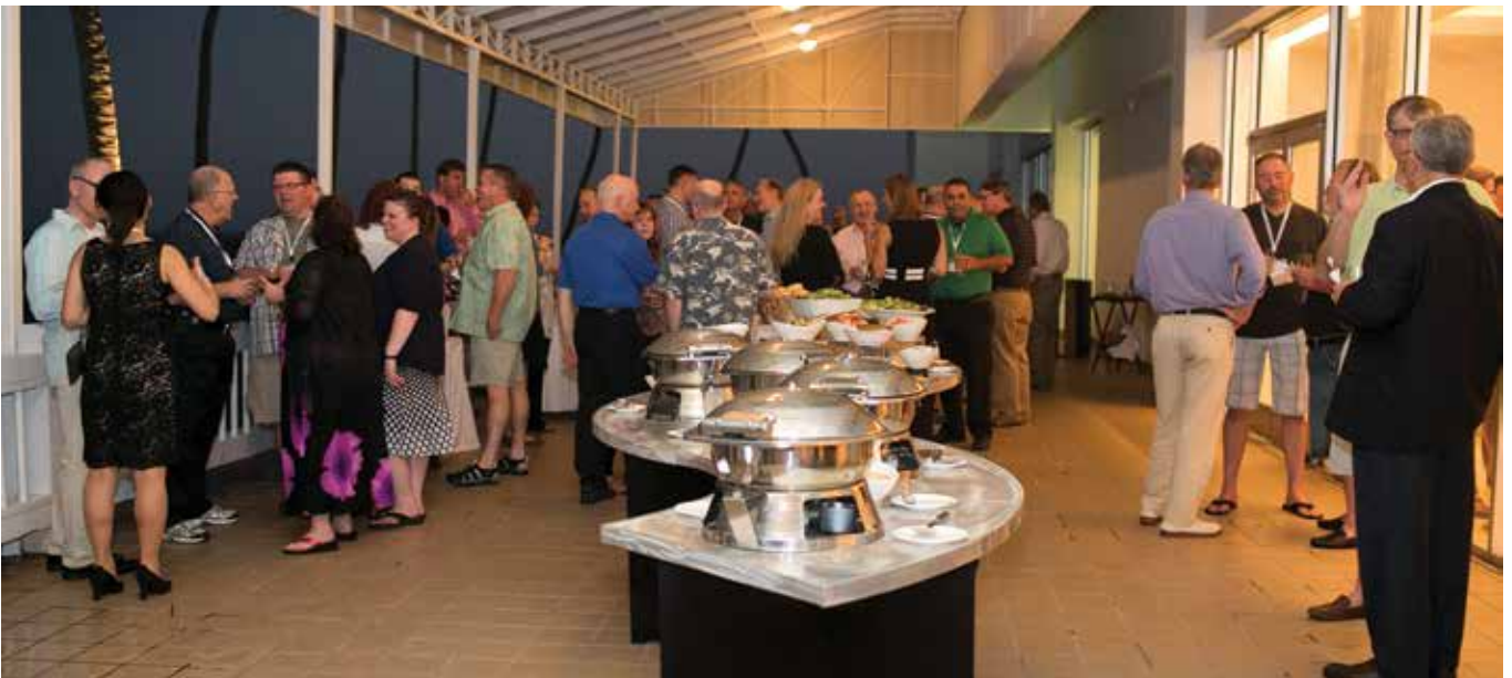
The large veranda at the Condado Plaza Hilton was the perfect place to host a celebration of Puerto Rico