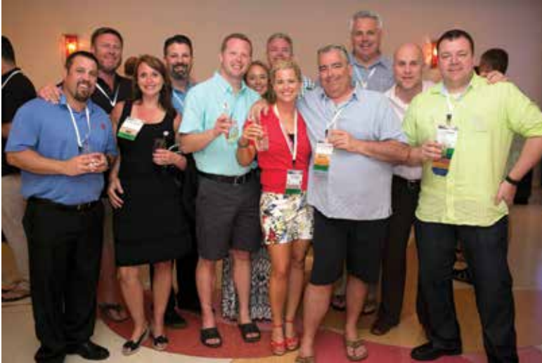
Everyone found a reason to revel at the Celebrate Puerto Rico party