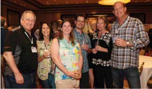
Everyone is all smiles at the Welcome Reception