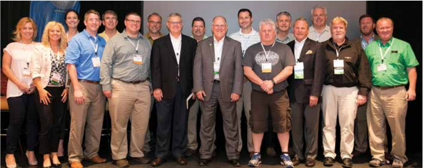
There were quite a few representatives from various chapters on hand at this convention to pose for this photo after the luncheon