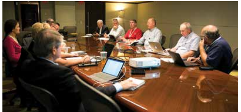
Much work gets done at the various committee meetings at each ICRI convention