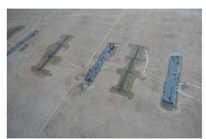
Carbon Fiber Strapping and Stapling Repair