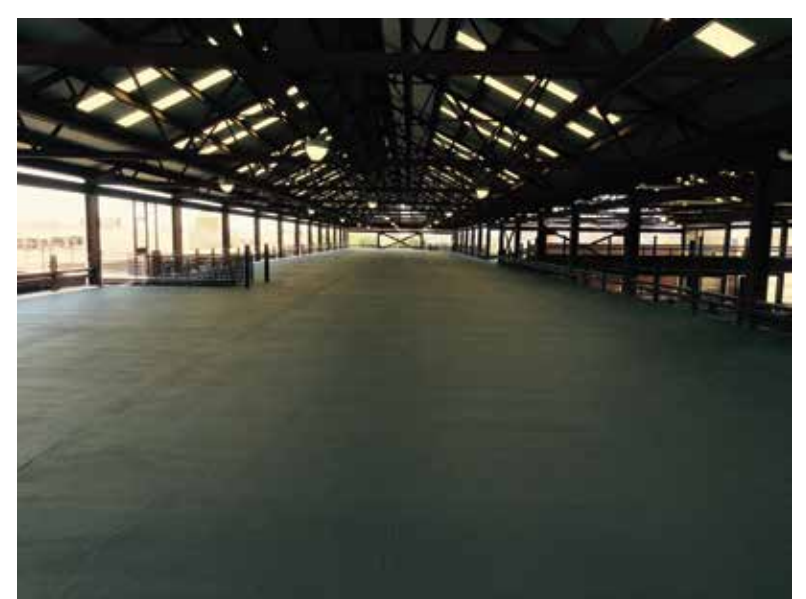
Broadway Lofts Completed Project