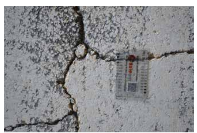
Crack Measured with Mil Gauge

Today, some eight months since the completion of the Project (and almost four years since installation of the first on-site test samples), there are no signs of failure of any aspect of the project. For that matter, there are no signs of the repair itself. Broadway Loft's tenants are enjoying a quiet, attractive drive surface on all five garage levels. There is no indication remaining of the damage once thought so severe as to require total deck removal and replacement.