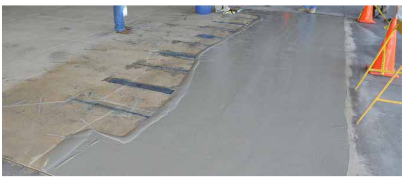
Cementitious Overlay Installation Over Strapping and Stapling Repair