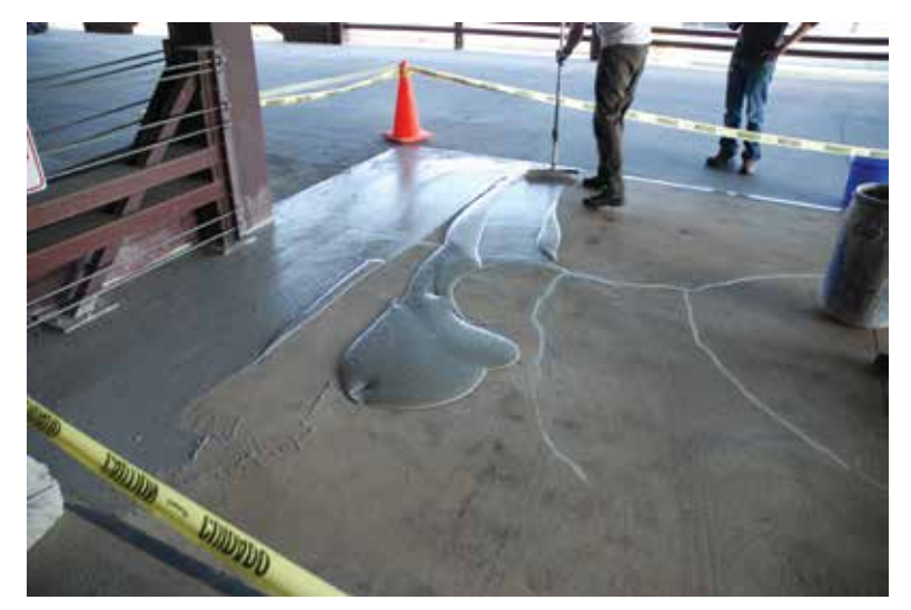
Applying Cementitious Overlay