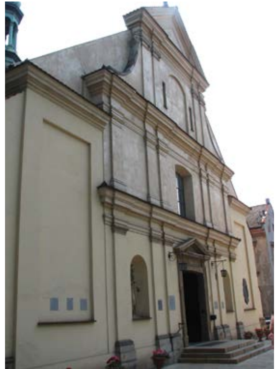
View of front façade

The current construction was built on the already-existing foundation from the structure destroyed in the past, much of which was done with local limestone. The stones used for the foundation and the limestone rock on which the church is located were subjected to washout and karst