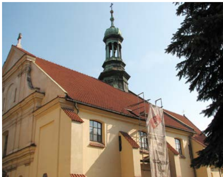
View of the southern façade

Cracking was seen in the chancel vaults, the main nave, and the aisles, which resulted from a lack of rigid support receiving the strutting forces through the walls. The original timber framing was not enough to stabilize the structure, so steel framing and braces were installed throughout the attic of the church, hidden to normal visitors. This new reinforcement allowed even transfer of the strutting forces through the walls, and movement of the church was decreased significantly.