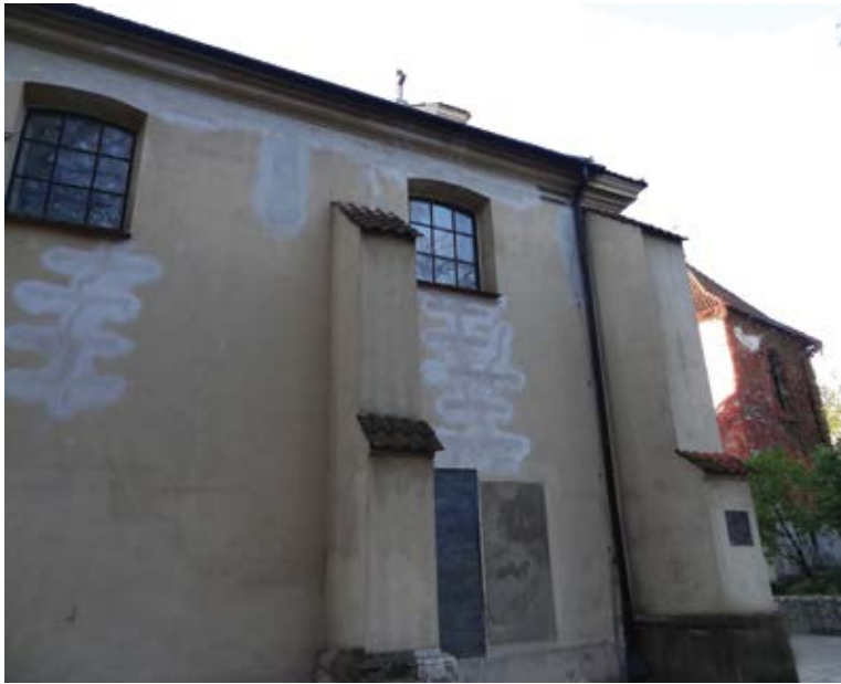
Finishing the wall with the mortar in the places of carbon fiber laminate strips and fabrics