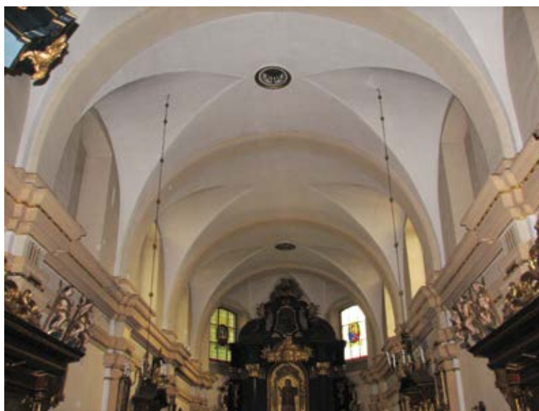
View of the vaults over the chancel