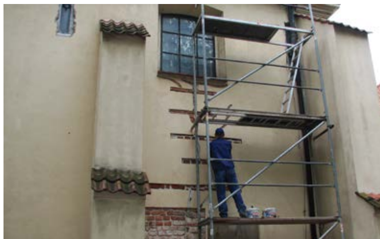
Preparation work on the substrate prior to applying the carbon fiber laminate strips and fabrics