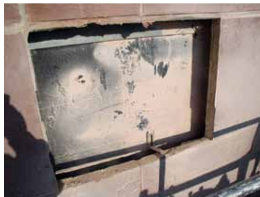
Fig. 3: Missing anchors