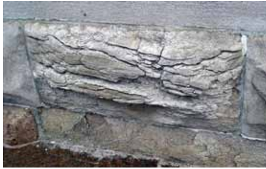
Fig. 7: Freezing-and-thawing damage exacerbated by the use of deicing products

Some of the most common causes of stone deterioration discussed may be minimized when emphasis is placed on the performance of design, material testing, and the use of adequate drainage systems. The following schematic procedure for the design of stone veneers is recommended: