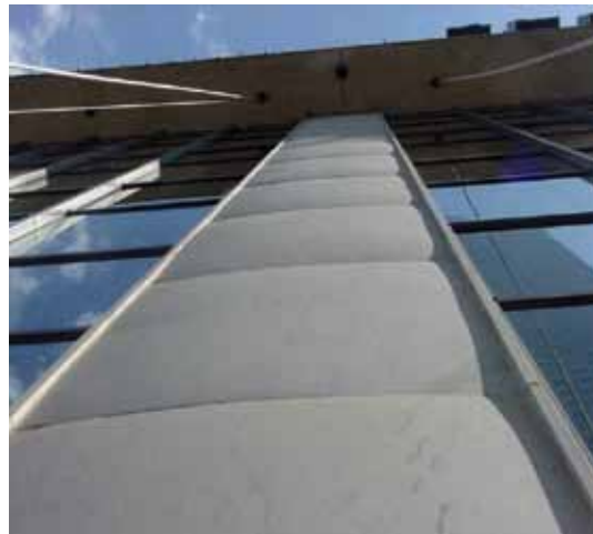
Fig. 2: Marble bowing due to hysteresis