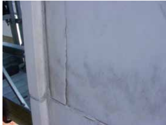
Fig. 1: Fissure in stone veneer