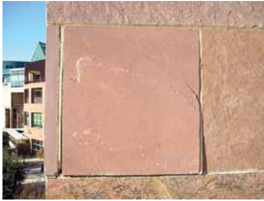
Fig. 4: Inadequate movement joints caused stone rotation