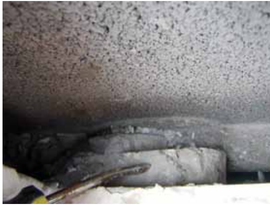
Fig. 5: Disintegration of (gypsum) mortar between stone and backup wall