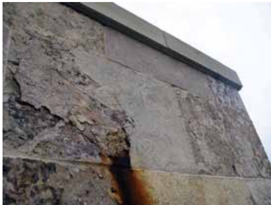
Fig. 6: Stone deterioration due to mineral deposits within the stone

documented (Schaffer 2004) that stone decay can occur between certain types of building stone. For instance, the association of a limestone with a sandstone frequently results in the deterioration of the sandstone. Sandstones in which the grains are cemented with siliceous material are not liable to direct attack by atmospheric sulfur gases. If calcium sulfate, resulting from the decomposition of a limestone, however, finds its way into such a stone, decay will most likely result. Calcium sulfate may be carried from the limestone by direct washing resulting from rain. Therefore, it is important to