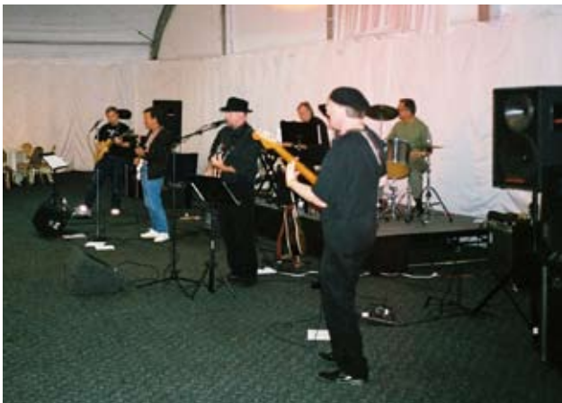
And the band played on... well into the night