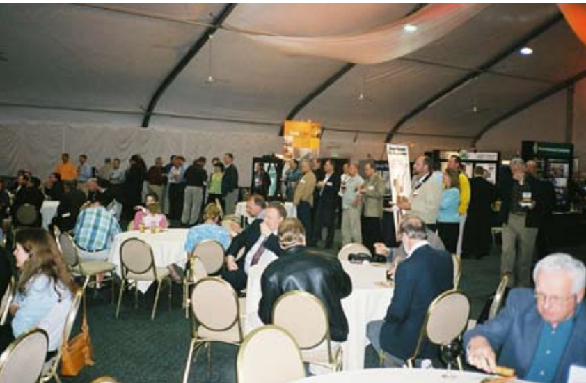
Convention attendees filled the outdoor tent at the Hyatt Regency Islandia for the Welcome Reception

The theme for the spring convention was The Business of Concrete Repair, which made for some very interesting presentations at the technical sessions, including talks from a lawyer and a surety company expert. Friday morning, the