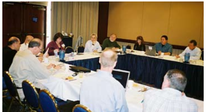
Members of the Technical Activities Committee get to work early on Saturday morning