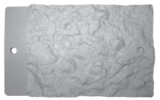
Fig. 1: CSP 10

The purpose of the guideline is to help ensure proper concrete surface preparation. Most protective systems and repair materials designed for application to concrete require some level of surface preparation. Manufacturers of these products often specify the type and quality of the surface preparation that is required to ensure the success of their product. The type of material, concrete substrate, and job-site conditions will impact the type of surface preparation required for the project.