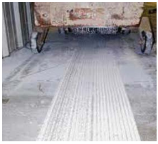
Fig. 5: Concrete removed during scarification

tion methods, allows one to select the appropriate surface preparation method(s). Following the previous example, where the goal would be to remove the clear sealer and create a CSP 3-5 in a dust-free environment, a contained dust-free system such as shotblasting, which is capable of producing a CSP of 2-9, may be an appropriate choice for the surface preparation necessary to install a new high-build coating.