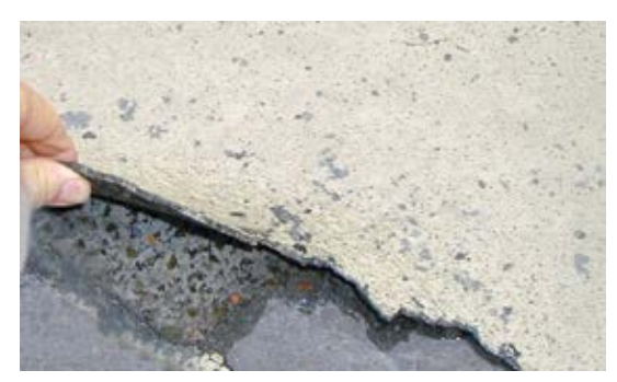
Fig. 2: Protective coating failure

Deadlines drive project schedules and surface preparation can be the loser. Surface preparation is often hidden as the work progresses and may be easily overlooked. Proper selection and execution of the surface preparation is key to a successful project.