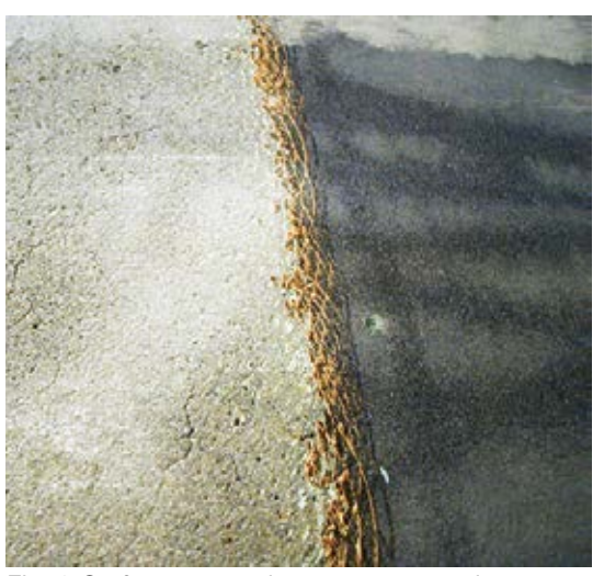
Fig. 4: Surface preparation to remove coating

material must be made in context with the substrate and job-site conditions. For example, on your project, it is determined that a clear sealer exists on the concrete surface (Section A.1, "Substrate Condition") and surface preparation must be done in a dust-free environment (Section A.3, "Job-Site Conditions"). The owner would like to install a new high-build coating and Section A.2, "Protective system and repair material requirements," suggests that the required surface profile should be CSP 3-5. With this information, you have the initial criteria to evaluate surface preparation options. Consulting the manufacturer's recommendations for surface preparation will provide further guidance.