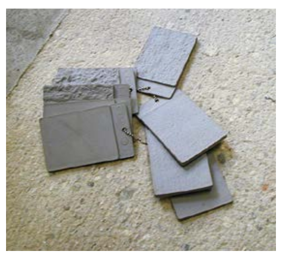
Fig. 6: CSP chips on prepared surface

If you already have the previous Technical Guideline No. 310.2 and CSP 1-9 chips, you can update your set by obtaining the new Technical Guideline No. 310.2R-2013 and the CSP 10 chip only.