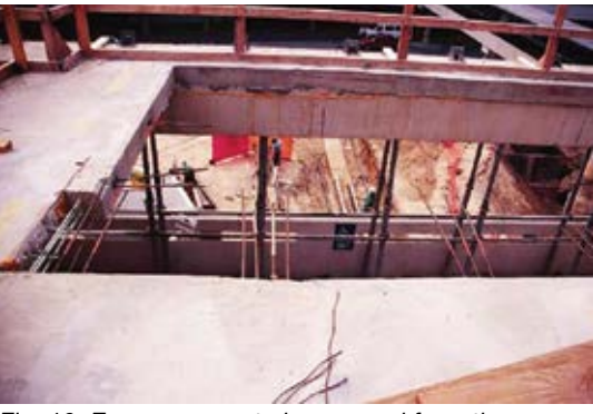
Fig. 10: Excess concrete is removed from the new opening