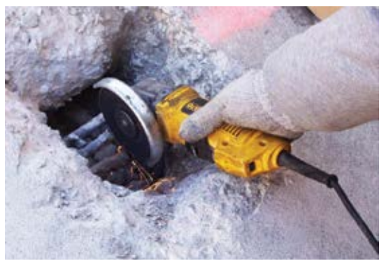
Fig. 2: PT strands are cut using a grinder

Small detensioning pockets are chipped into the slab, exposing the strands using chipping hammers. The strands are then individually detensioned using a handheld grinder (Fig. 2). PT strands are typically detensioned in phases to minimize the loss of prestress at any given time during construction.