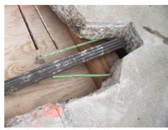
Fig. 4: Anchorage pocket after chipping

a. Using a detensioning collar to temporarily lock off the strand at a predetermined location in the slab (normally at the boundary of the new opening). Although detensioning collars can be a very effective means of eliminating the sudden release of energy during detensioning, they cannot be used in situations where strands are grouped or bundled together.