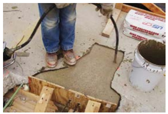
Fig. 8: Vibrating repair material for proper consolidation

of the remaining concrete in the opening is completed using conventional concrete breakers (Fig. 10). The edge of the opening can be left as a rough, unfinished surface or it can be formed and poured to create a formed edge.