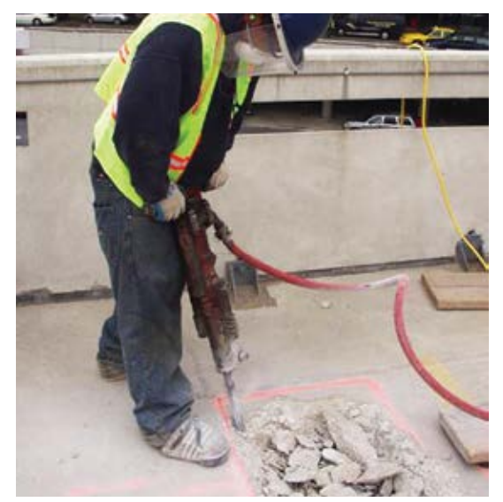
Fig. 3: Anchorage pockets being chipped out