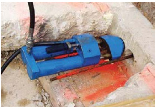
Fig. 9: Strands are stressed using a monostrand ram