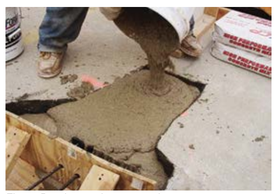
Fig. 7: Pouring anchorage pocket

Step 6: New PT anchorages are placed in the pockets along with the appropriate backup reinforcing steel (Fig. 5 and 6).