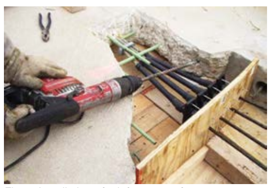
Fig. 5: Installation of reinforcement for anchorage pocket

Step 5: New anchorage pockets are chipped in the slab at the intersection of the strand groups and the perimeter of the opening (Fig. 3). The width and length of the pockets depends on the number of stands in the group and the location of the new anchorage relative to the strand profile's high and low points (Fig. 4). If the new anchorage is near a strand high point, then the pocket will have to be long enough to allow the strand to be reprofiled so that the new anchorage can be located at the middepth of the slab.