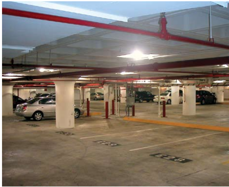
Fig. 9 and 10: Garage and mechanical penthouses in use

By job's end, the restoration contractor had successfully executed and managed over $7 million of work in less than 40 weeks. Under the best circumstances, this project would have been a challenging endeavor. Its size and aggressive schedule, the limited access for such a large quantity of material and equipment, and the planning needed to avoid disturbing the office building above all would make the project noteworthy even without the terrorist threats that transpired.