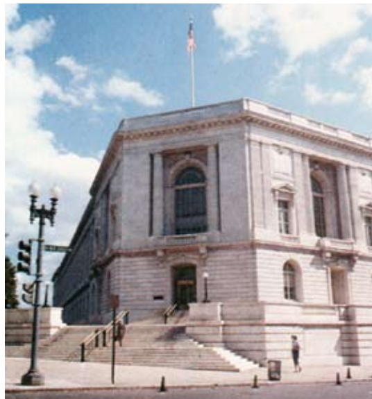
Fig. 3: Cannon House Office Building

Security was an important issue because the members of the House of Representatives would continue to work in the building while the restoration took place. Restoration technicians had to undergo security screenings, were issued identification badges, and had to enter and leave through a guarded entrance. Deliveries to the site required 48 h prior notice and first had to stop at a government inspection station remote from the Cannon Building.