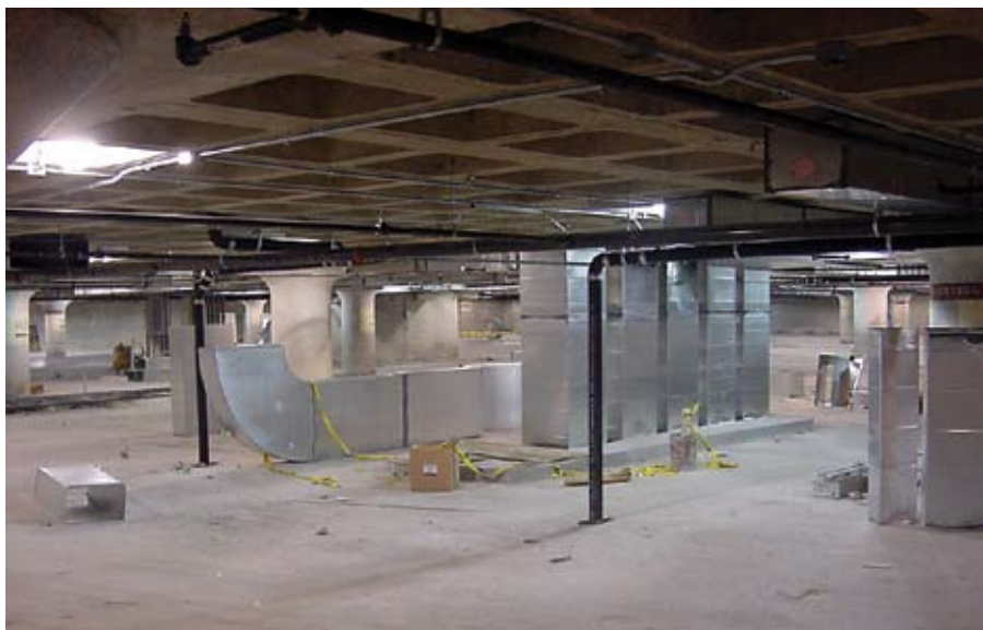
Fig. 4: Mechanical equipment removal prior to concrete demo

The several weeks lost during the anthrax investigation could not simply be absorbed into the progress schedule. The AOC, however, did not want to subject building residents to any more hardship by extending the completion date of the project. The AOC and the contractor met frequently to discuss how delays could be minimized and the project finished most quickly. The restoration contractor and subcontractors, sensitive to the unique events that had occurred, developed a strategy to work overtime, increase manpower, overlap tasks, and find all means possible to finish