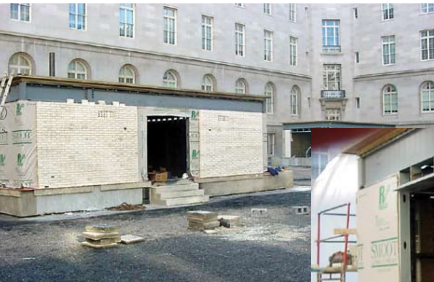
Fig. 6 and 7: Mechanical penthouses under construction