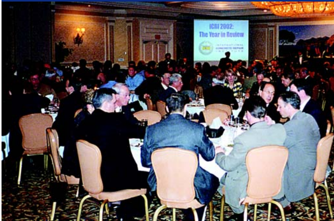
A crowd of almost 200 gathers for ICRI's 15th Annual Membership Meeting on Monday, February 3, at the Monte Carlo Hotel in Las Vegas