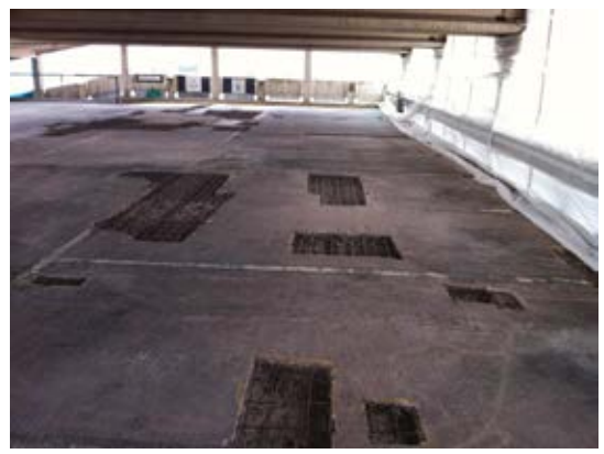
Fig. 3: Corroded areas prepared for patching

system may not be completely effective to control corrosion over the entire structure and multiple solutions, which work in combination with each other, could enhance the protective effect of each system.