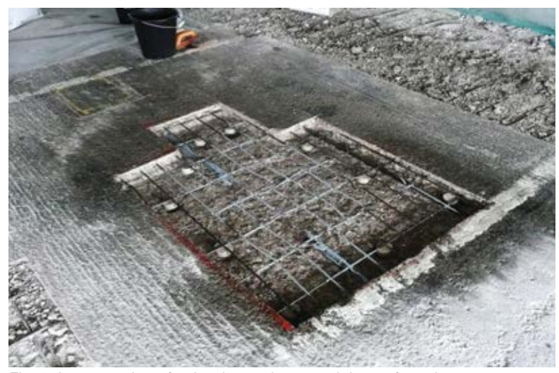
Fig. 6: Incorporation of galvanic anodes at periphery of patch

lized for up to 15 to 20 years, thereby improving durability and reducing maintenance. While this type of corrosion protection is a simple and commonly used technique, it only protects areas just outside of the repair area from incipient anode formation. Other high-risk undetected corrosion sites are not affected by this installation.