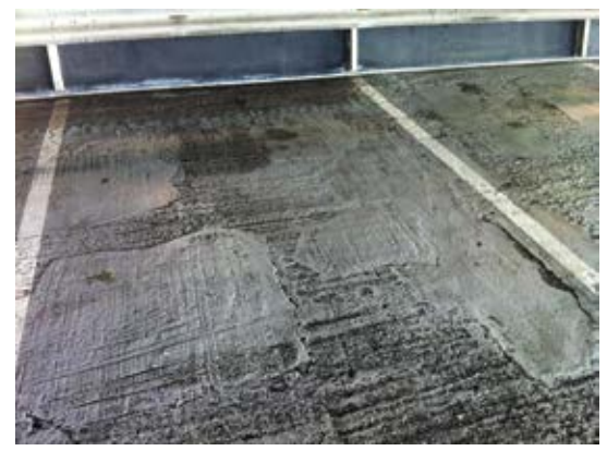
Fig. 1: Cosmetic surface patching

easily identified and accounted for by visual signs such as concrete spalling and delamination, other potential corrosion sites remain invisible to the naked eye and sample testing may not identify the hidden vulnerabilities.