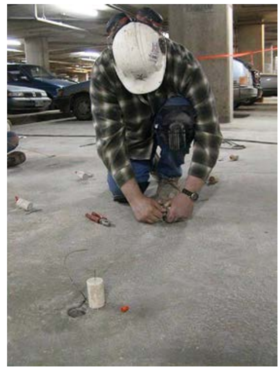
Fig. 8: Installation of zonal embedded galvanic anodes

anodes is one method that might address this risk. Half-cell mapping can identify those high-risk areas that may be related to minimal concrete cover and/ or very high chloride concentrations. Once these at-risk areas are detected, galvanic anodes (Fig. 8) could be installed in the identified areas. A completed galvanic anode installation can be seen in Fig. 9.