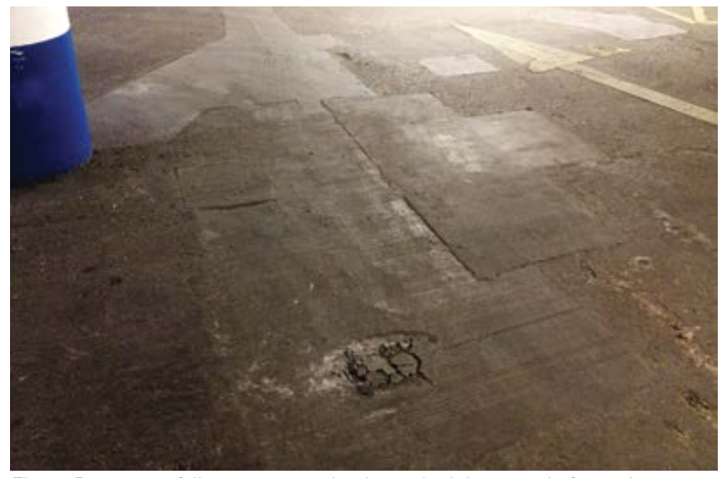
Fig. 5: Premature failure on car parks due to incipient anode formation