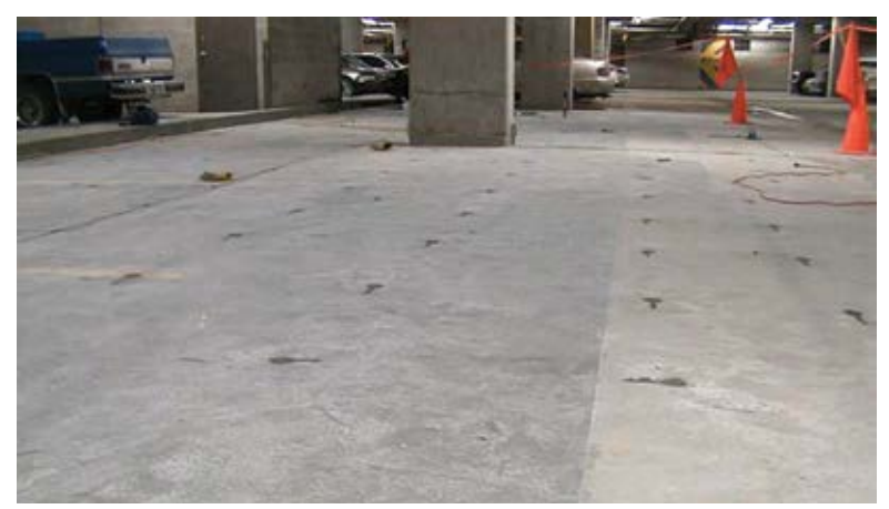
Fig. 9: Completed galvanic anode installation

Alkali-activated embedded galvanic anodes have been used to provide targeted corrosion control for multi-story car parks in the UK for more than a decade. Galvanic systems do have a finite life and in temperate climates such as the UK, they are likely to last in the region of 15 to 20 years.<sup>8</sup> Their holistic use with systems such as waterproofing membranes and properly placed high-quality concrete repair mortars provide a multi-faceted approach to controlling corrosion when aesthetic and safety improvements to parking structures are undertaken. Controlling corrosion may extend the service life of a parking structure and