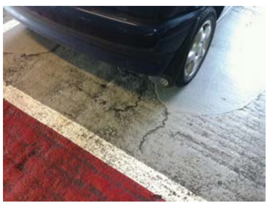
Fig. 2: Cracking and delamination

The risk of corrosion throughout a parking structure can vary greatly depending on the location and exposure conditions. In many cases, a single