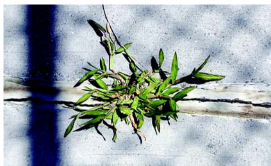
If you have to pull weeds out of a joint, it is probably time to replace the sealant. (Cohesive failure with organic growth.)

One of the primary reasons for premature sealant failure is insufficient movement capability of the sealant. If a sealant capable of 25% movement is used in a joint that experiences a 50% increase in width, there is likely to be a sealant failure. The other major factor in sealant failures is surface preparation, or lack thereof. In particular, joints in new construction or repair areas are sometime not prepared—it is assumed that because the concrete