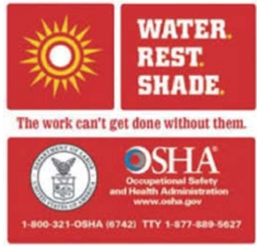
Fig. 5: OSHA offers a variety of heat awareness posters<sup>12</sup>