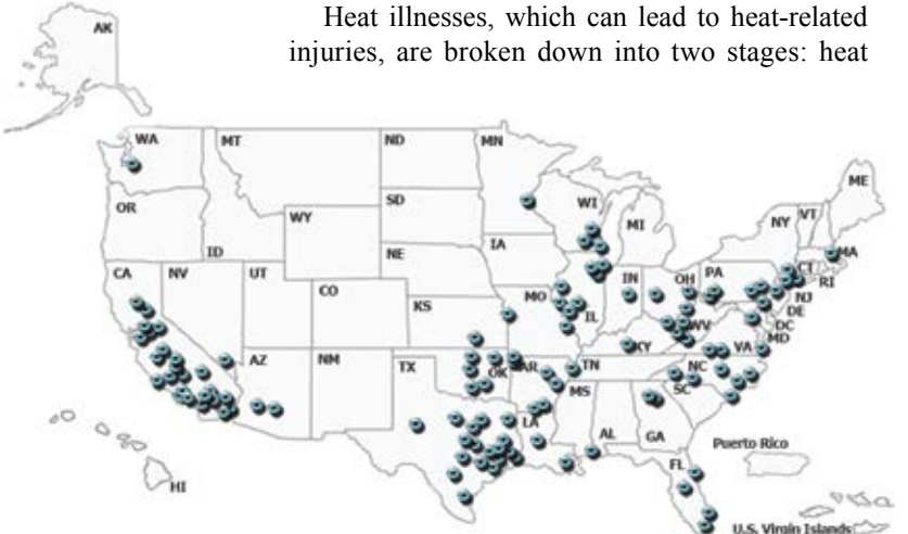
Fig. 1: Heat-related fatalities between 2008 and 2013<sup>2</sup>