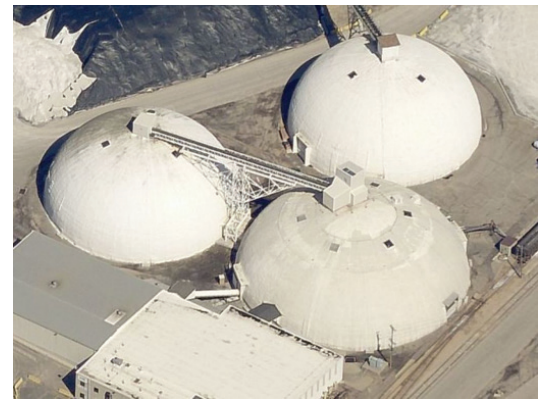
Fig. 1: Overhead view of salt storage and packaging facility

In addition to the repair and strengthening design, implementation of a corrosion management plan was necessary to mitigate the ongoing