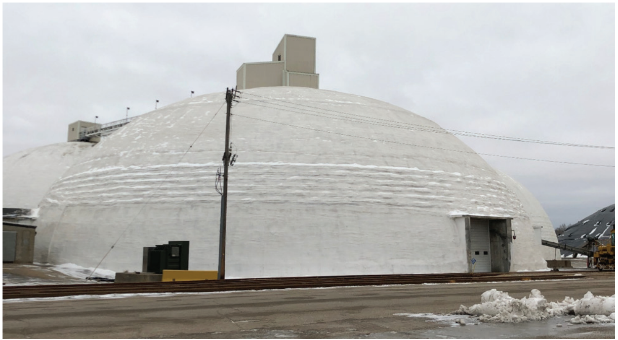
Monolithic Salt Dome, Savage, Minnesota

SAVAGE, MINNESOTA SUBMITTED BY VECTOR CONSTRUCTION, INC.