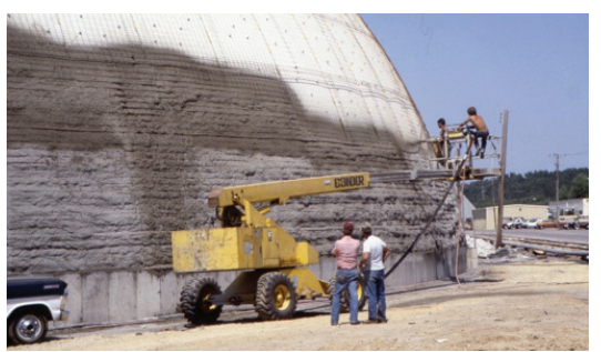
Fig. 3: Shotcrete placement over welded-wire fabric and post-tensioning tendons during original construction