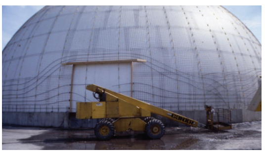
Fig. 2: Monolithic dome reinforcing during original construction prior to shotcrete placement