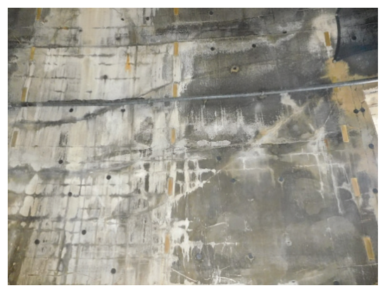
Fig. 4: Shadowing of shotcrete created voids behind welded wire fabric reinforcement and post-tensioned tendons