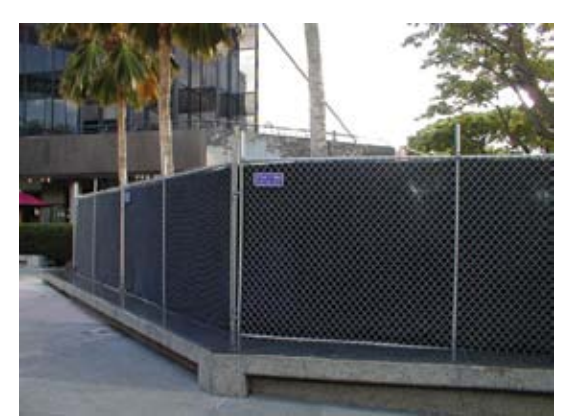
Fig. 2: Restricting access to work areas with fencing

Administrative controls are changes in work procedures, such as written safety policies, rules, supervision, schedules, and training, with the goal of reducing the duration, frequency, and severity of exposure to hazardous situations and may include managing the exposure of the employee by limiting the amount of time the employee is working in the noisy environment. This could be