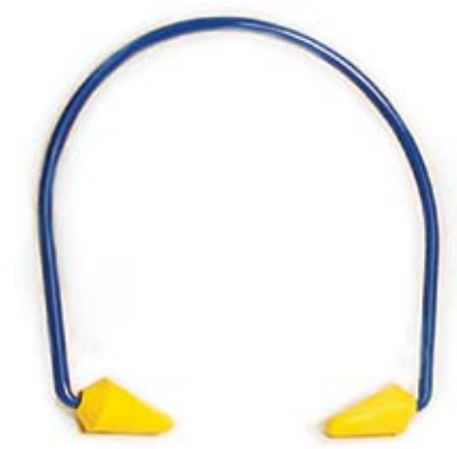
Fig. 6: Ear bands