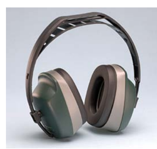
Fig. 3: Earmuffs

Expandable foam earplugs —These (Fig. 4) are designed to fit snugly into the ear; when compressed and inserted correctly, they will expand to fill the ear canal and seal against unwanted noise.