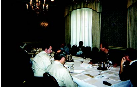
Figure 3: ICRI members hard at work at a Technical Committee Meeting