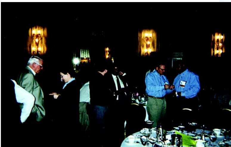
Figure 2: Networking during the General Session