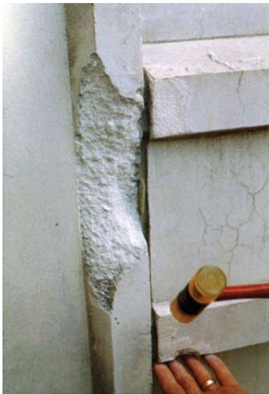
Fig. 9: Patches that have failed and have become unstable should be removed

truly noticeable should be repaired (refer to Fig. 8). Pieces with spalls or chips greater than 8 in. (203 mm) square should be replaced. No matter the size, an acceptable patch must not be visible from more than 20 ft (6 m) away. §