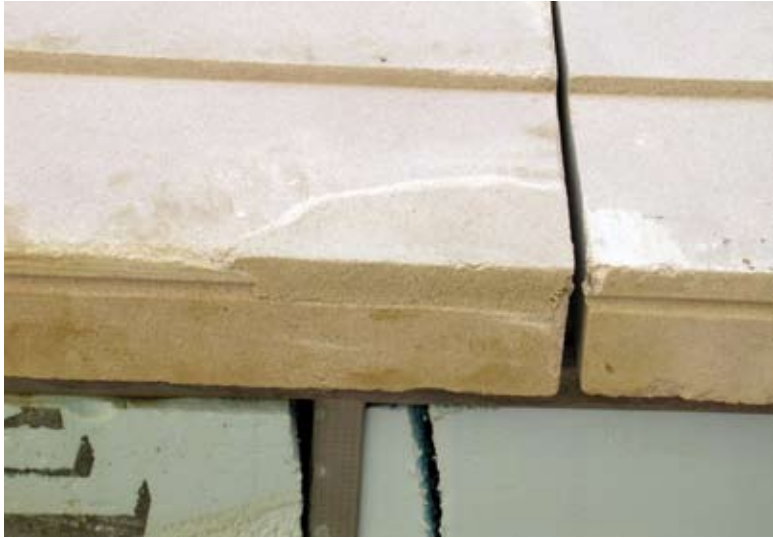
Fig. 8: A patch relying solely on cementitious bond in an overhead condition. Note the failure of the feathered edge at left

Despite duplicating the cast stone components and their proportions, patches rarely match in all environmental conditions because the density and absorption of the original material cannot be replicated when the patch is installed. Because it is so difficult to obtain a good match between the patching material and the cast stone, only damage