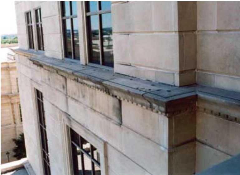
Fig. 2: Heavily soiled cast stone at a water table due to water run-off

Some manufacturers will attempt to control cracking resulting from volume changes by introducing reinforcing steel in both directions across the face of the cast stone piece. Unfortunately, this is often ineffective because of the difficulty in