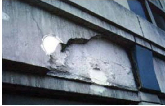
Fig. 10: Delamination of the face mixture from a large spandrel panel. Round patches are patches from prior core sampling

Over the years, many creative approaches have been developed to restore, repair, and maintain cast