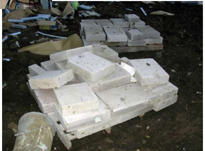
Fig. 7: Poor storage and handling cast stone on site can result in improper loading and damage

achieving adequate consolidation of the material around the reinforcing steel to control and distribute the cracking. Poor consolidation around reinforcing steel in the transverse direction (perpendicular to its span) can actually form weak planes through the thickness where cracks are more likely to form.