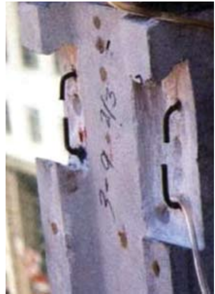
Fig. 12: Preparation for patch repairs. Note the saw cut edges and supplemental anchors to engage the new patch material

must be cut to eliminate feather edging, and mechanical anchoring is necessary to ensure that if the patch does lose bond, it will stay engaged in the substrate (refer to Fig. 12). These practices will produce a patch that is more noticeable, but one that will be far more durable.