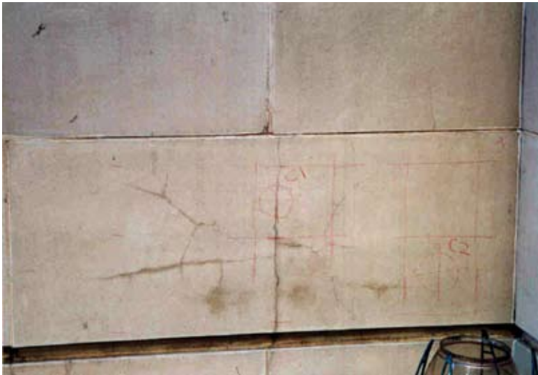
Fig. 4: Crack resulting from restraint from shrinkage