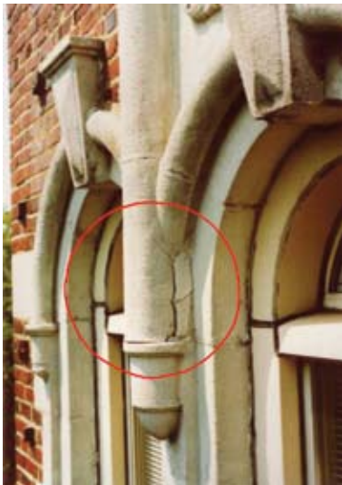
Fig. 5: Cracking that resulted from corrosion of reinforcing steel