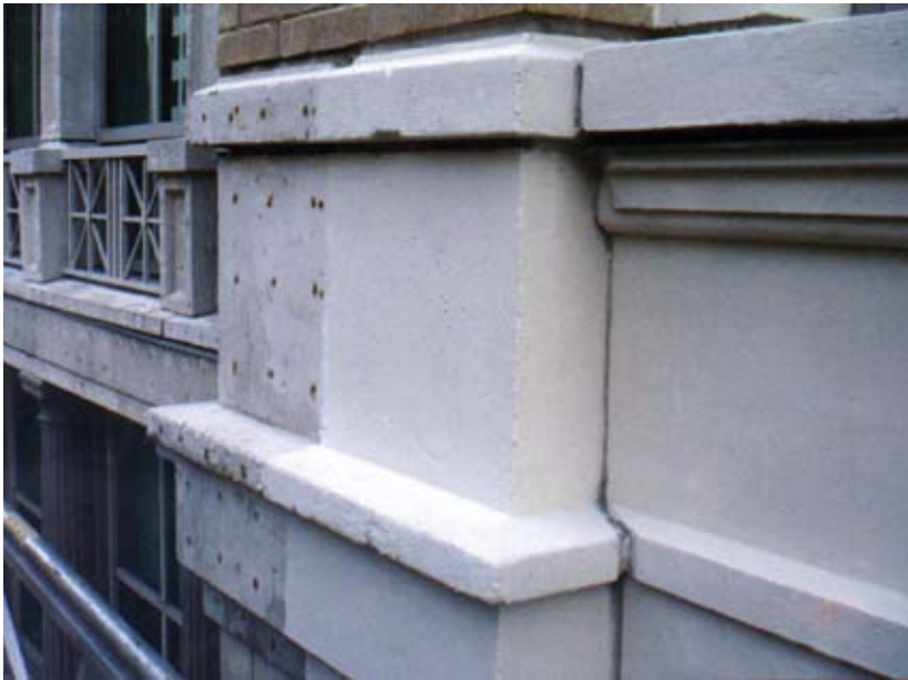
Fig. 11: Example of architectural coating applied over supplemental anchors