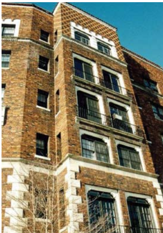
Fig. 1: An example of cast stone used as ornament at quoins, belt course, and window surrounds on this circa 1920s building

Wet casting of cast stone is virtually identical to the process used for precast concrete: a form is constructed and then filled with a mixture of aggregates, cement, some additives, and water. Some wet-cast methods can involve multiple lifts of material, or variations between the face mixture and backup mixture. It is allowed to harden and cure for a period of time, and then the form is